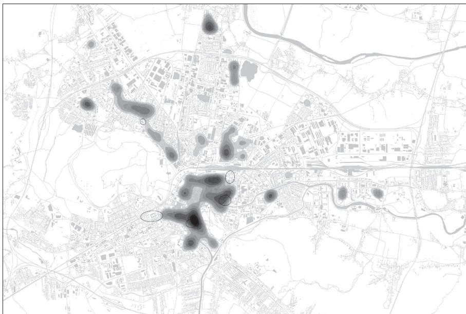
Figure 1: HEATMAP OF ARTS AND CULTURE BUSINESS ENTITIES (LOCATIONS OF ARTS DISTRICTS ARE MARKED SEPARATELY IN LJUBLJANA)